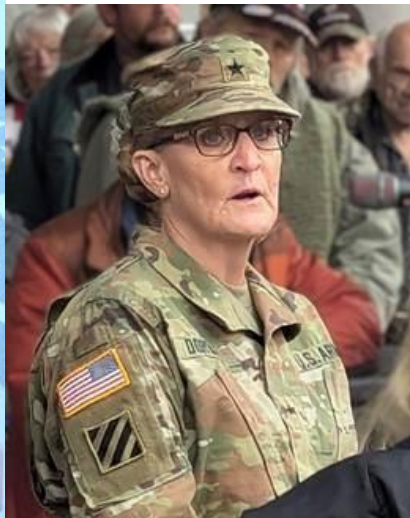
General Renea Dorvall